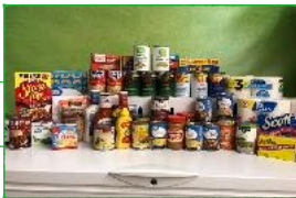
These photos represent a sampling of the goods and gifts that came in during December.