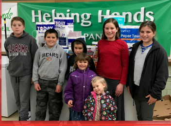
The Happy Hustlers 4H Club helps out again!

To think about the needs of others, to share, to give unselfishly—these are acts of kindness that show a special human quality. Helping Hands of Roseville is blessed to be supported by a very kind and generous community. Thank you!